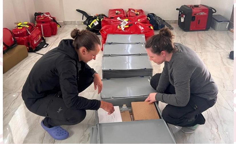
Logistical tasks in Rafah, Gaza, 09.02.2024.