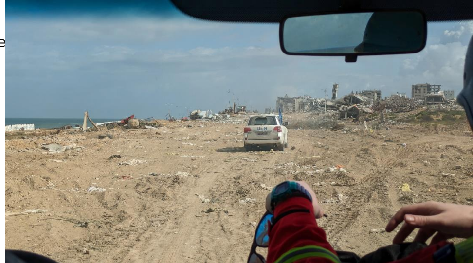
Gaza City is destroyed. The drive up north, where we conduct medical evacuations from, asks a lot of our drivers. March 2024.

Financially, this mission is also a major challenge for us: we started it solely from our own funds and donations.