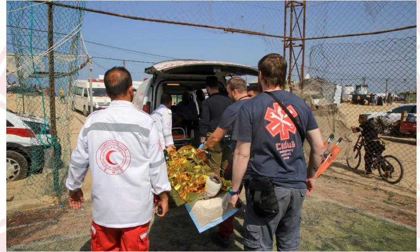
Joint work at the TSP with the Palestinian Red Crescent Society. March 2024.

The mission is initially planned to continue until end of May. We are considering an extension.