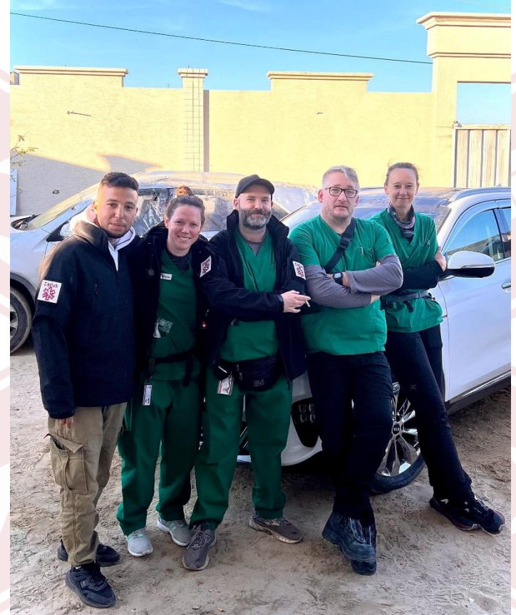
CADUS Emergency Response Team in Gaza, February 2024.

The team is self-sufficient regarding its own supplies too with own food, water filtration, and power supply.