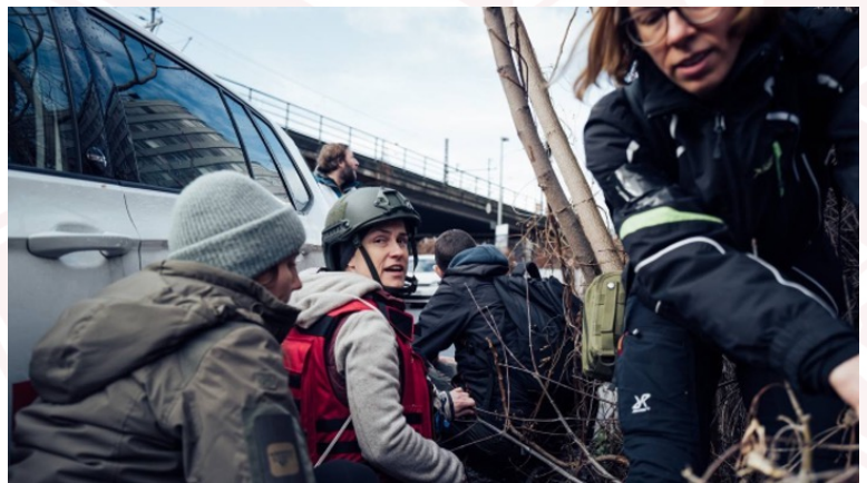
Our makerspace is not only the hub for our logistics, but also regularly serves as the backdrop for our HEATs.