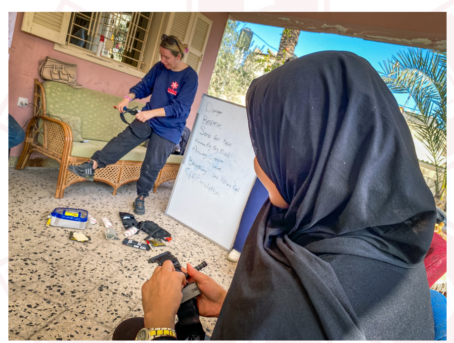
In our training, we teach important techniques, such as applying a tourniquet to tie off extremities with heavily bleeding wounds and thus prevent bleeding to death.

The training courses also promote the self-help capacities of local communities beyond the acute situation.