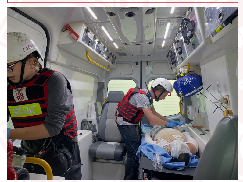
Wearing helmets and protective vests makes the already challenging care of intensive care patients on MedEvacs even more difficult.