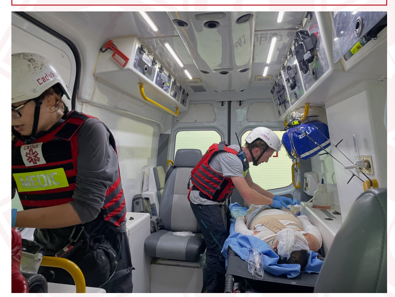
Wearing helmets and protective vests makes the already challenging care of intensive care patients on MedEvacs even more difficult.