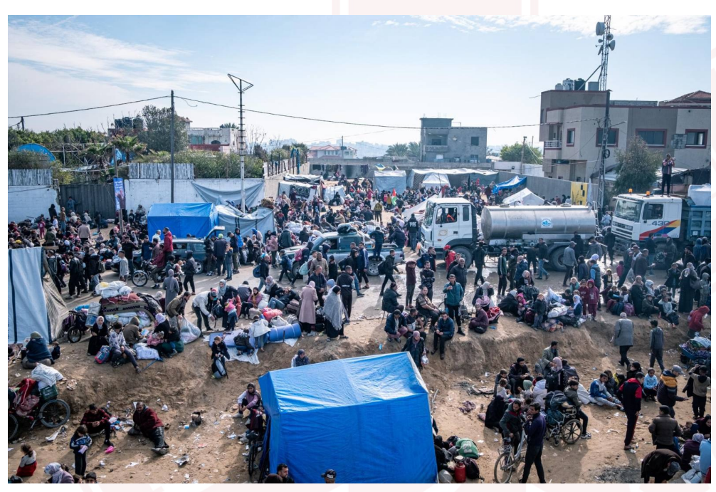
There is no safe place in Gaza. People are forced to constantly seek refuge in new places and hope that the fighting doesn't flare up again.