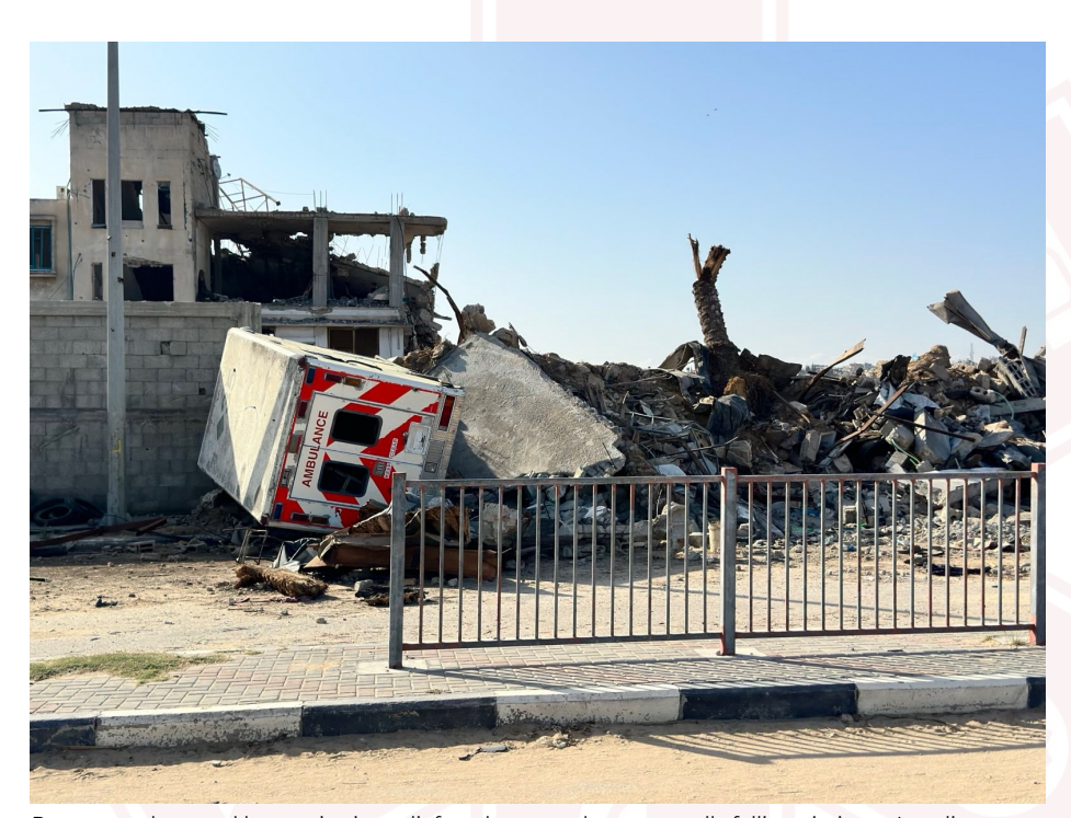
Rescue workers and humanitarian relief workers are also repeatedly falling victim to Israeli attacks on Gaza.

In such an emotionally and politically charged conflict, public relations is also a challenge. Adhering to humanitarian principles is therefore all the more important to us.