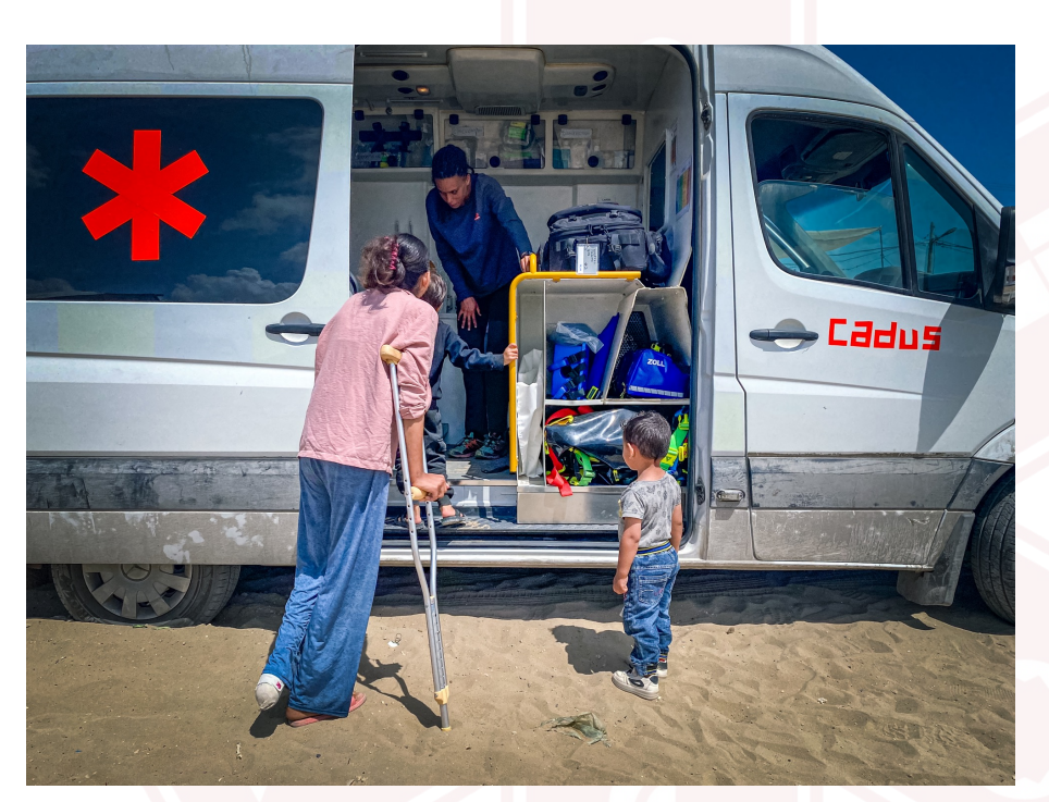
Our emergency response in Gaza is only possible thanks to the donations of our supporters.

CADUS e.V. Volksbank Berlin IBAN DE55 1009 0000 2533 5240 04 BIC BEVODEBBXXX