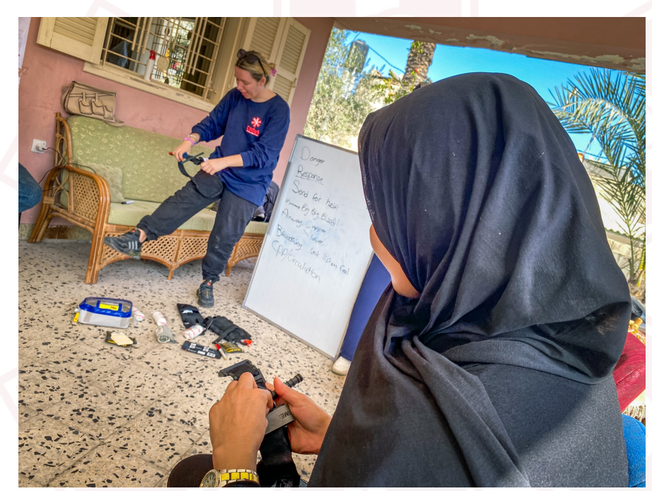
In our training, we teach important techniques, such as applying a tourniquet to tie off extremities with heavily bleeding wounds and thus prevent bleeding to death.

The training courses also promote the self-help capacities of local communities beyond the acute situation.