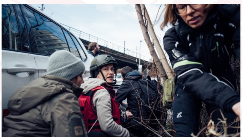
Our makerspace is not only the hub for our logistics, but also regularly serves as the backdrop for our HEATs.